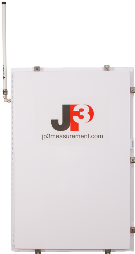
JP3 Verax CTX Analyzer

Multi-Stream Measurement of Hydrocarbon Composition, API Gravity, Vapor Pressure, BTU, and Other Properties in Natural Gas, NGL, Condensate, Crude Oil and Refined Products