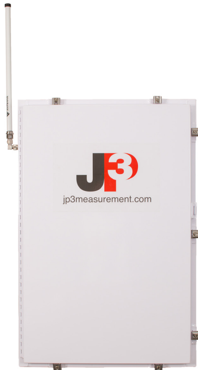
JP3 Verax CTX Analyzer: Capable of measuring natural gas up to 1650 BTU/SCF without sample conditioning

The JP3 Verax CTX for Natural Gas has been certified to exceed the repeatability and reproducibility criteria of common standards referenced for custody transfer (GPA2261-13 and API 14.1)