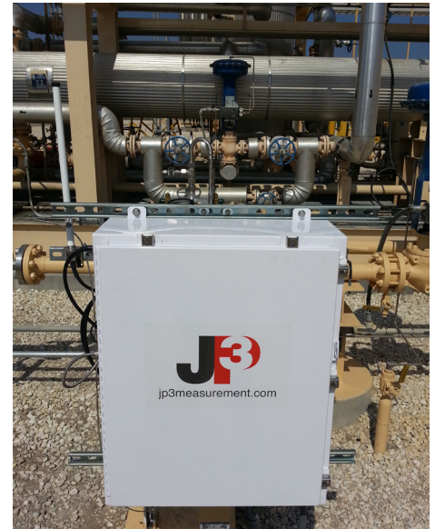
Typical Installations at Customer Sites: Verax CTX control panels, and optical probes